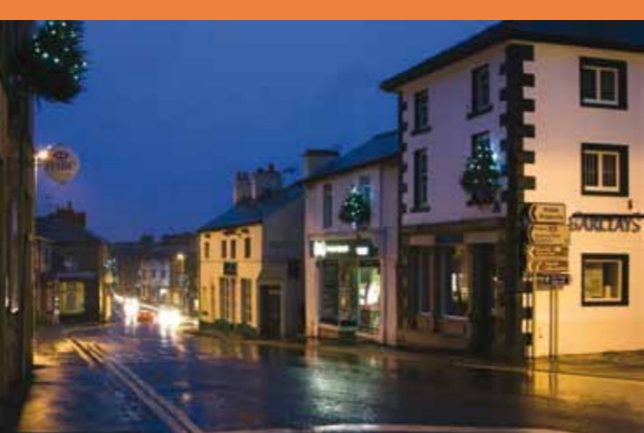
High Street ▲

Bentham hosts a variety of places to stay – ranging from comfortable pubs, to guesthouses and bed and breakfasts. There are also self catering cottages and award winning caravan parks.