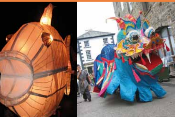
Fish Lantern ▼ © Gayesart.com Dragon ▼ © Looking Well

Bentham can trace its history back to Roman times - a section of ancient road has been found near Low Bentham - although the town derives its name from Anglo Saxon roots: bent meaning rough grass, and heim meaning home. In the Domesday Book it is recorded as the manor of 'Bentain' and in Tudor times it appeared as 'Bentum'. Bentham is a small but lively market town, well-known for its auction mart. It offers a wide range of independent shops, a friendly welcome and a fantastic location! Today Bentham is a small but lively market town, well-known for its auction mart. It offers a wide range of independent shops, a friendly welcome and a fantastic location! Bentham and Low Bentham, lies cradled between the Yorkshire Dales and the Forest of Bowland, and within striking distance of the Lake District, too. Bentham is accessible by rail via the Leeds to Morecambe line and is an ideal centre for exploring these areas, by bike, on foot, by horse or car. The Great Stone of Fourstones ▼ © Natural England / Charlie Hedley