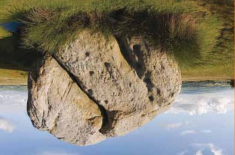
Big Stone ▼

Bentham Tourist Information Point is housed in the Town Hall on Station Road. It is usually open from 10am to 3pm, April to October, and is manned by volunteers. Here you can find a place to stay, or pick up information about events and activities in the area – the staff will be happy to help you! Telephone 015242 62549 or email tip@benthamtowncouncil.co.uk for information or visit www.aboutbentham.org.uk The town's oldest and most curious attraction is the Great Stone of Fourstones, or the Big Stone, to be found up on Burnmoor to the south of the town. Legend has it that there were once three more of these massive boulders, thrown or dropped by a giant. In reality it is a glacial erratic, brought here in the Ice Age and left when the ice melted and retreated. The views from up here are impressive and not to be missed. Bentham Tourist Information Point is housed in the Town Hall on Station Road. It is usually open from 10am to 3pm, April to October, and is manned by volunteers. Here you can find a place to stay, or pick up information about events and activities in the area – the staff will be happy to help you! Telephone 015242 62549 or email tip@benthamtowncouncil.co.uk for information or visit www.aboutbentham.org.uk