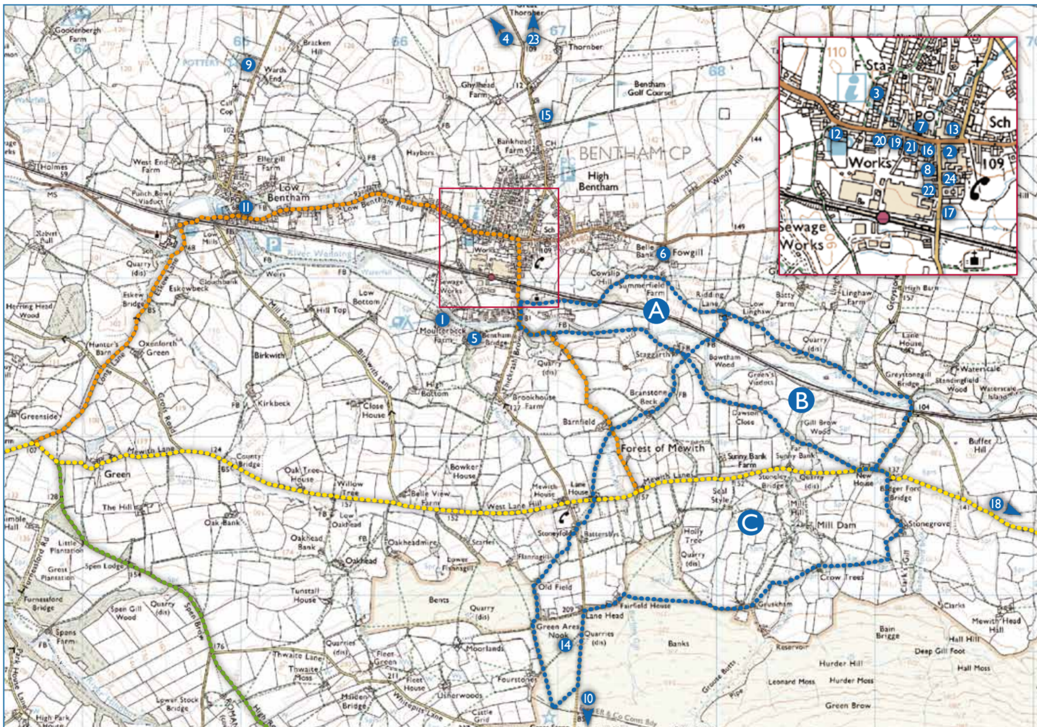
This map contains Ordnance Survey material with the permission of Ordnance Survey on behalf of the Controller of Her Majesty's Stationery Office © Crown Copyright. Unauthorised reproduction infringes Crown Copyright and may lead to prosecution or civil proceedings. Lancashire County Council Licence No. 100023320 2014. 84095a Printed on recycled paper.