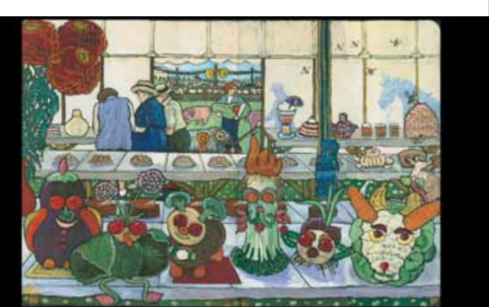
Painting ▲

Bentham is home to a surprising number of artists, attracted by the town's location and strong creative community. Alongside a stained glass studio, a pottery, an art gallery and a photographic studio, you will find paintings, photographs and sculpture on display in unusual settings. Look out for the Queens Bloomers, high in a tree in Low Bentham, and the painted bus shelter in High Bentham. Looking Well Studios in King Street provide opportunities for visitors to try out arts and crafts activities throughout the year. Pioneer Projects, the charity which runs Looking Well, is known nationally and internationally for their groundbreaking work using the arts and celebration to promote health and wellbeing. You will find a wide range of complementary therapies available in the town and a lively music scene.